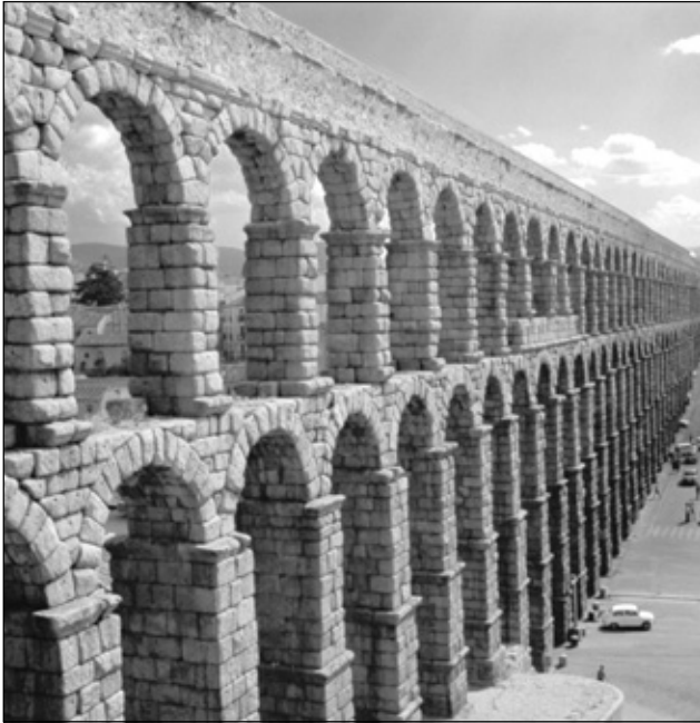
One of many aqueducts constructed by the Romans. Some Roman aqueducts are still in use today.

What is wrong with the above scenario? Several things. If you guessed that no one—child or adult—would venture out alone in the year 1015, you are correct. If you further guessed that most people who lived on manors were serfs with neither access to a cart nor permission to leave of their own free will, you are right again. And if you pointed out that there may or may not have been a decent road, you are extremely clever!